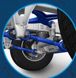
Steering and Suspension